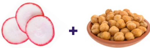
Slice radishes + roasted chana