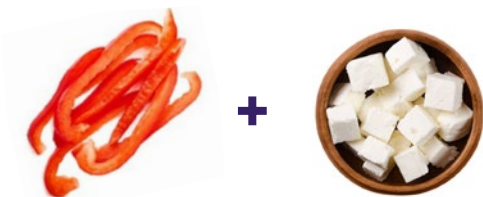
Red bell pepper slices + paneer cheese