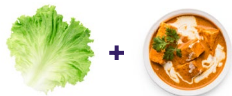
Lettuce cups + masala tofu

If you're craving a snack, check in with your body. Are you low on energy? Is your stomach empty? Avoid eating when you're bored or stressed. Instead, save snacking for when you need extra fuel to make it to the next meal.