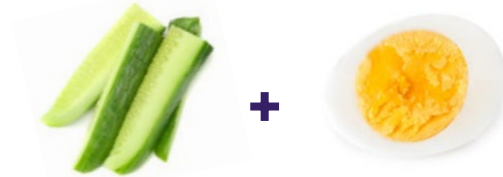
Cucumber spears + boiled egg