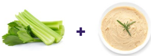
Celery sticks + hummus